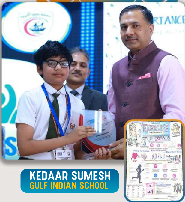
KEDAAR SUMESH GULF INDIAN SCHOOL